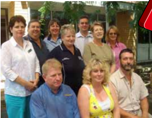
Photo of ACSSO Executive: